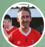
Davy Russell's Best